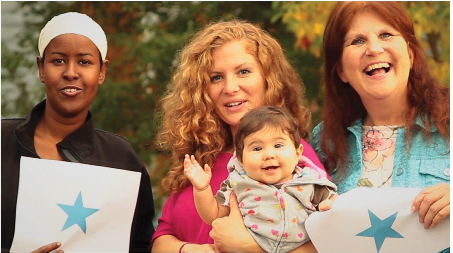
These women organized a Famine relief dinner for Somalia.