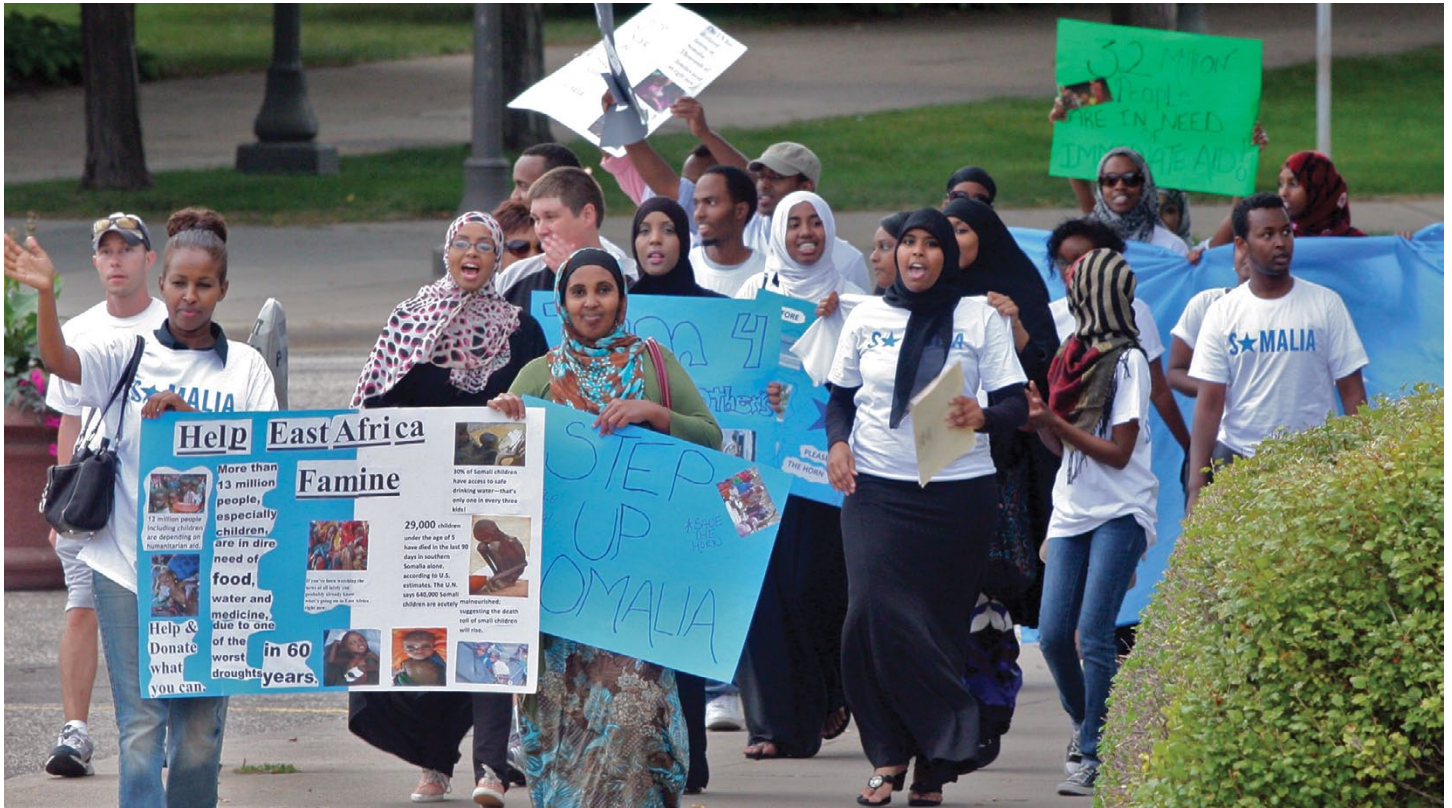
Inspired by the Canada-based group Step UP for Somalia, people around the world participated in Walks for Famine relief.