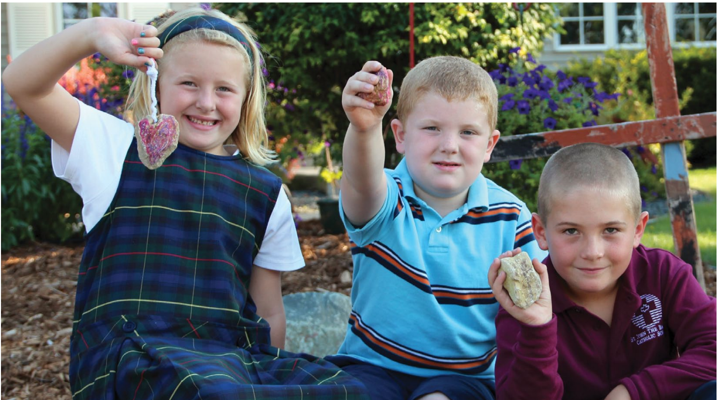
These kids gathered, painted, and sold rocks door-to-door to raise funds for Famine relief.