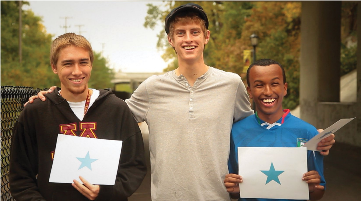
College students organized “Run to Unite”—a 5K Run/Walk to raise funds for Somalia Famine relief.