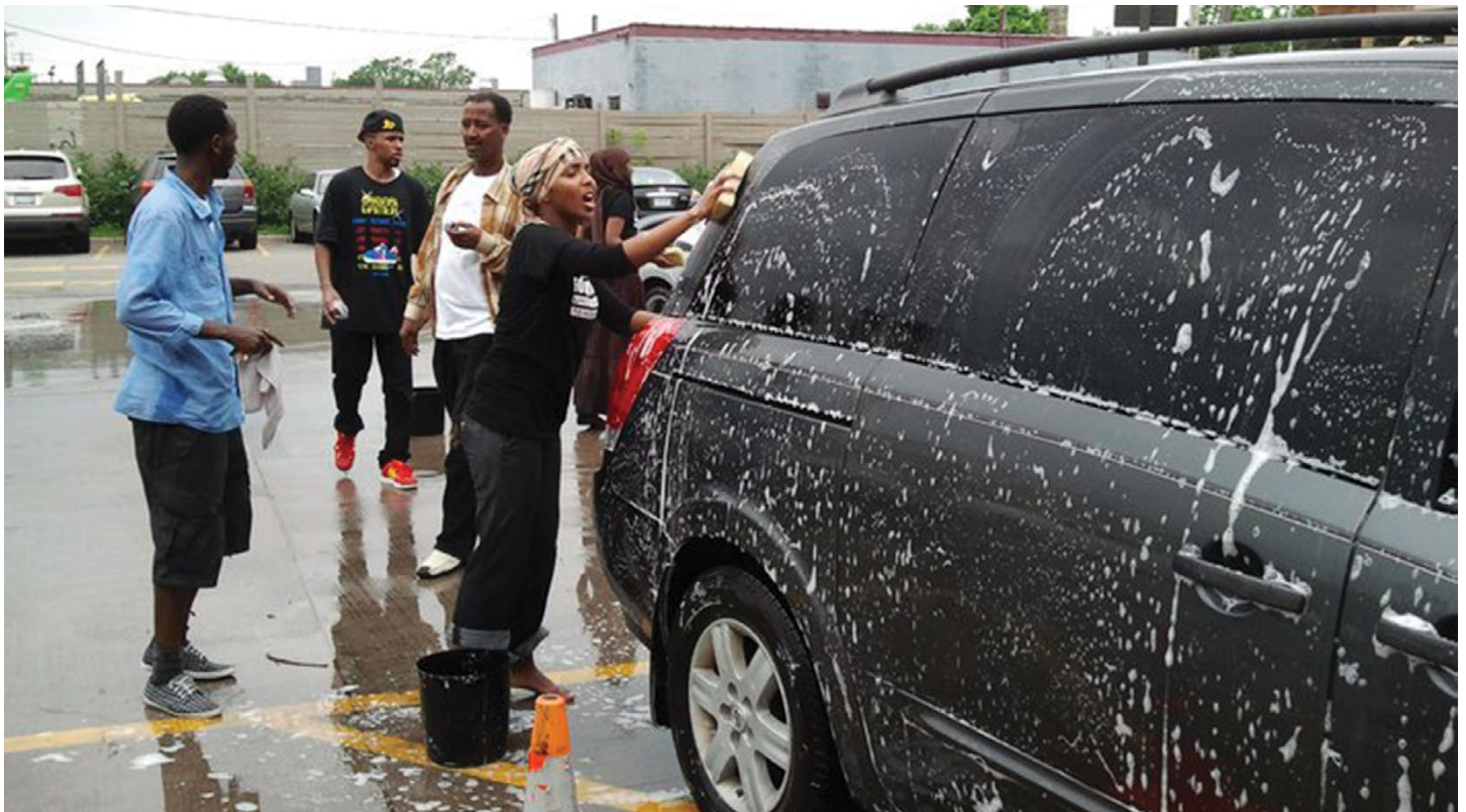
Somali-American students raised funds by washing cars and hosting bake sales to help—and raised more than $11,000.